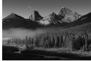
to the mountains