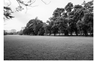
to the park